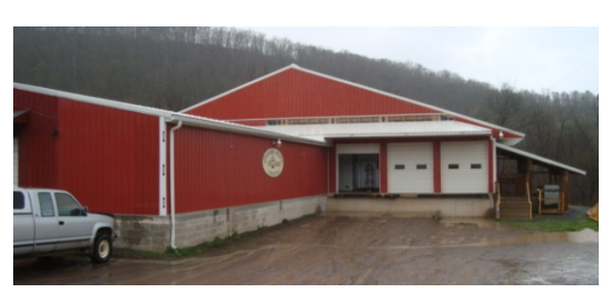
Figure 8. Aggregation facility of Tuscarora Organic Growers Cooperative.

op staff meet in mid-winter to review the history of products delivered to the cooperative and then build a Commitment Plan for the coming growing season. The plan includes the produce to be grown, the amount to be delivered, and the time of delivery. The Commitment Plan represents a good faith effort on the part of the farmer to deliver the desired product at a designated time period to the cooperative. Product is graded and packed at the farm. Product exceeds industry