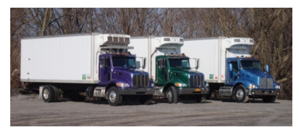
Figure 5 . Portion of Eden Valley Growers truck fleet.

by the buyer. Delivery is accomplished by 8 truck drivers hired seasonally to drive 4 tractor trailers and 4 box trucks owned by the cooperative. These drivers deliver product to local buyers. An additional driver is contracted to deliver product at