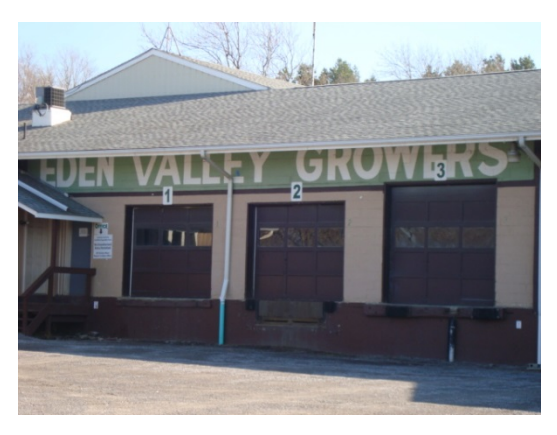
Figure 3. Loading dock at Eden Valley Growers

prosperity that the cooperative brought to the farm business. Awareness of the high quality of the product to be delivered to the cooperative is transmitted from one generation to the next. Third and fourth generation family members now belong to the cooperative. The cooperative is open to new members. A person seeking membership needs to build a relationship with a current member to learn and embrace the culture of the cooperative. The potential member needs to grow product desired by the cooperative and adopt the production practices of Harmonized Good Agriculture Practices, NYS