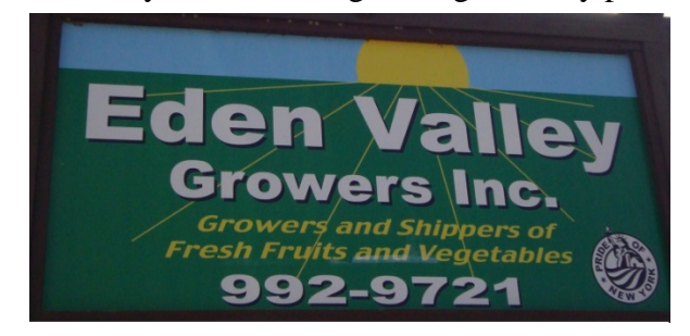
Figure 4. Eden Valley Growers logo on co-op owned tractor trailer.

Similar vegetables from each grower will be 'pooled' or commingled, marketed, and sold together. Each producer who participates in the