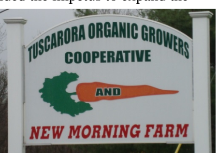
Figure 7. Sign post at Tuscarora Organic Growers located at New Morning Farm.

collaboration from 3 farms to 7 farms. First, customers (consumers, chefs, food cooperatives) had increased awareness and desire to purchase organically grown produce. This demand and market opportunity could not be adequately supplied by the three individual farms. Second, organic production techniques had become more standardized and third-party verification allowed for products to be labelled "certified organic." Third, changes came in the wholesale market channel. Early on, organic produce sold through the channel was not of sufficient