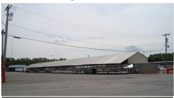
Figure 14. Covered sales area at Capital District Cooperative

offices and storage facilities at the market. Produce arrives on trucks owned, leased, or contracted by farmers and once sold is loaded onto the buyers trucks.