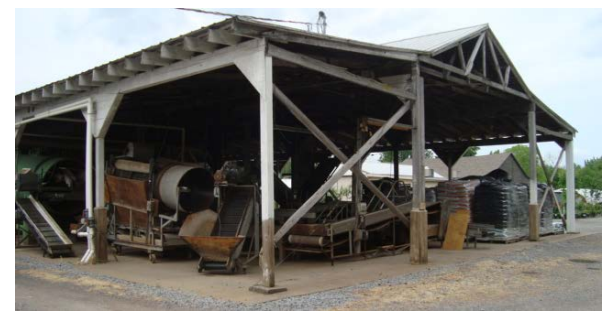
Figure 11. Packing equipment stored at George's Farm Products, Inc. Oriskany, NY

farms are within 40 to 60 miles of the aggregation facility with the furthest 220 miles away. Each grower is located in a micro-climate,